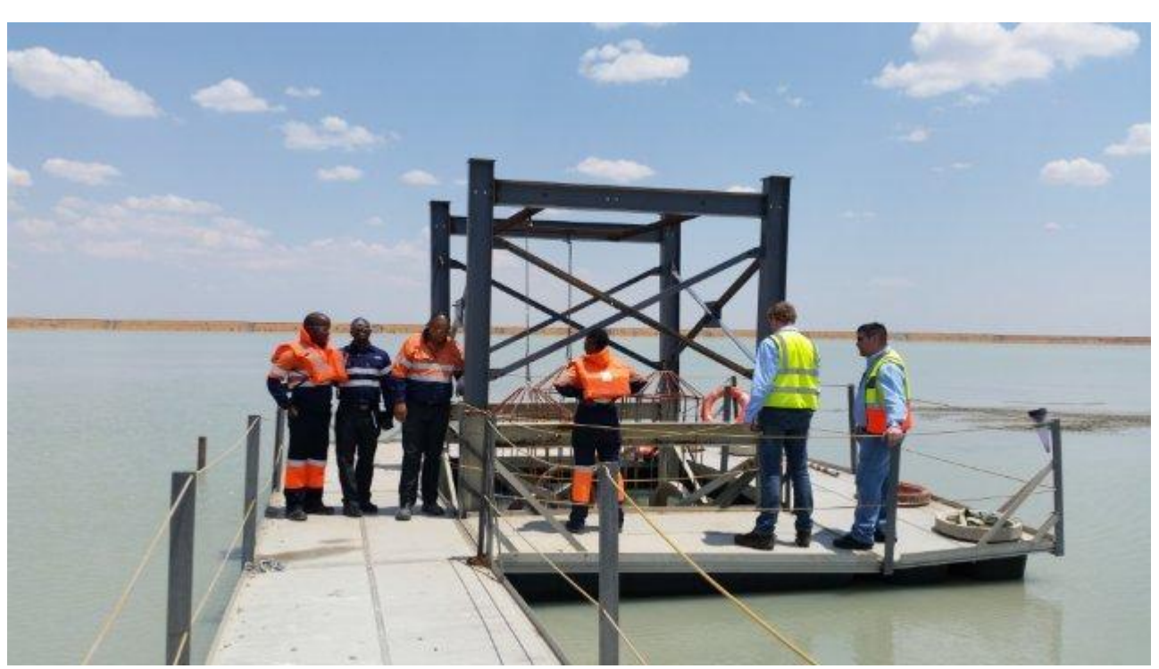
Penstock tower Walkway 6 years after installation complete (under the African Sun)