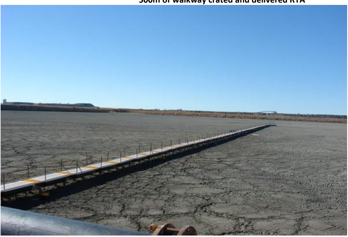
Another project for Debswana diamond mine 270m long