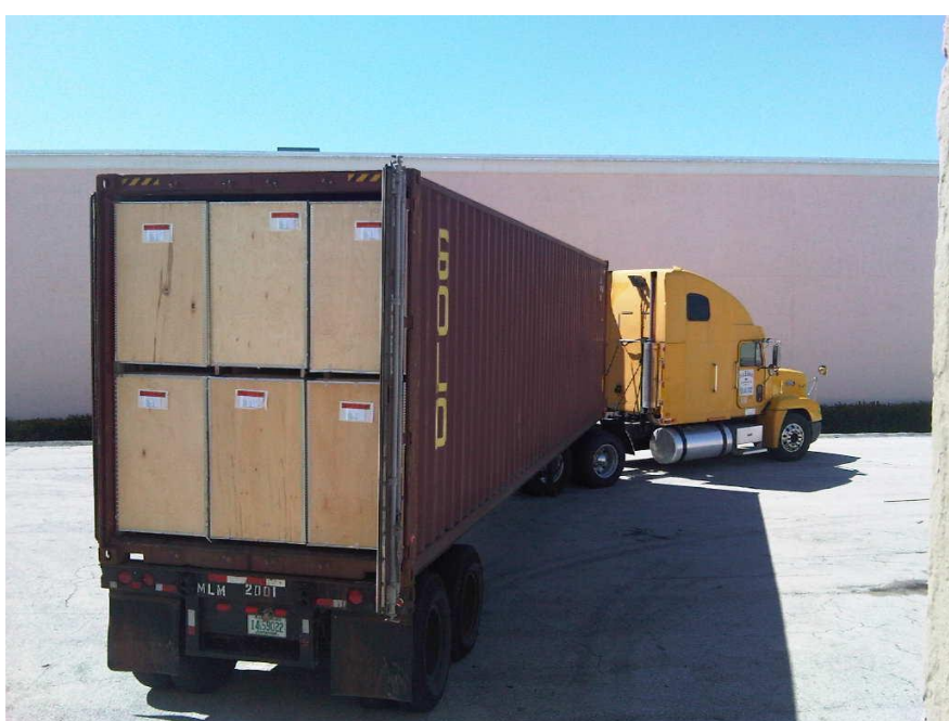
500m of walkway crated and delivered RTA